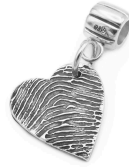
Heart | $344

The sterling silver charm carrier fits Pandora bracelets.