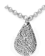
Teardrop 20" $355 | 24" $435