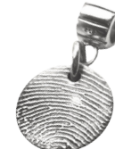
Circle | $344