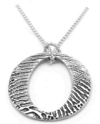
Eternity 20" $375