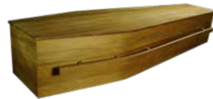
Archtype Silver Beech