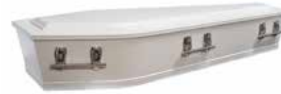
Painted White Raised Lid

Environmental considerations include material choice, assembly options, handles, finishes, and using less material to make the caskets.