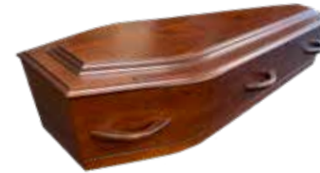
Raised Lid Solid Pine, Mahogany