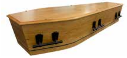
Flat Lid Solid Pine, Teak