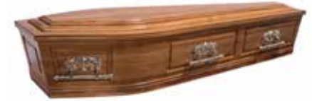
Solid Rimu Panelled