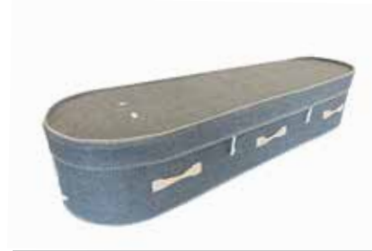
Grey Woollen Casket